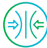
Wide Hardness Range